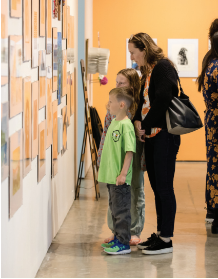
Art's Alive and Well in the Schools exhibition opening 2022.