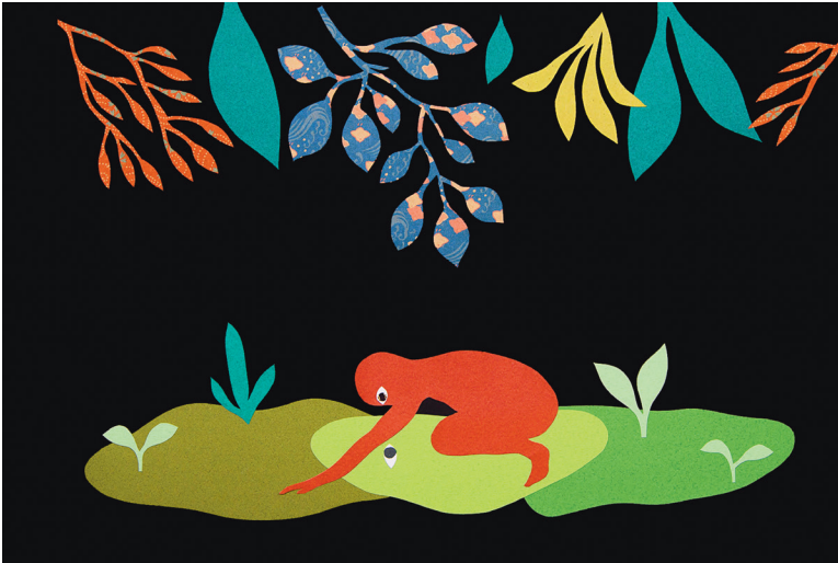
April Matisz, A Kind of Sentience , collage, 2020.

A necessary act for survival, gathering involves traversing a landscape, coming to know it by searching and assessing, selecting and collecting. The physical act of picking berries,