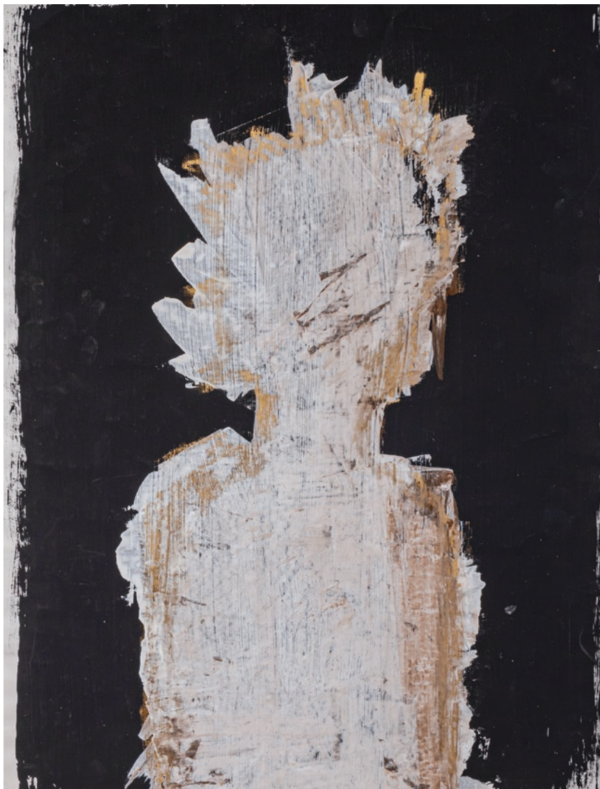
Nathan Eugene Carson, Negro (girl I) (Negro series), 2015. Mixed media on paper, 46 x 61 cm. Courtesy the artist. Photo: Toni Hafkenscheid.