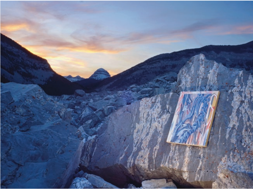
Ryland Fortie, Drivetrain , oil on canvas, Crowsnest Mountain, sunset, 2023.

of the natural and the human-made in the wider world. Visually, the porous networks of Tafoni holes permeate the exhibition. They are cut into a plastic rain barrel, etched into plexiglass, and carved into wooden sculptures. Whether as visual pattern or metaphor, Tafoni holds Fortie's references to dinosaurs, machine parts, bones, and smoke as elements in a bio-technic mythology.